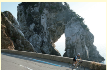
Shirasaki Sea Coast