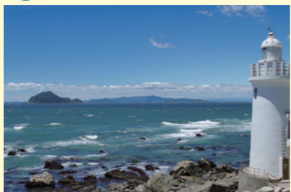
Cape Irago Lighthouse