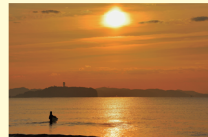
Shonan Sea Coast