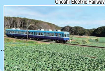
Choshi Electric Railway