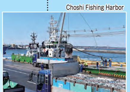
Choshi Fishing Harbor