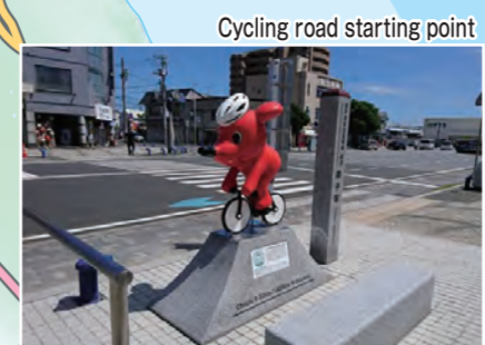
Cycling road starting point